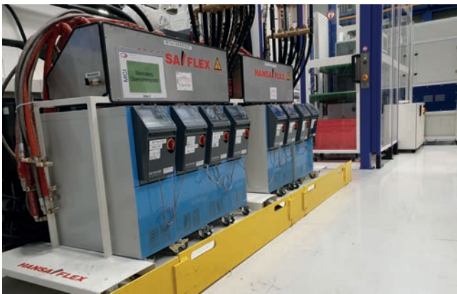
Fig. 1. Up to ten Thermo-5 temperature-control units per machine are clearly and neatly arranged