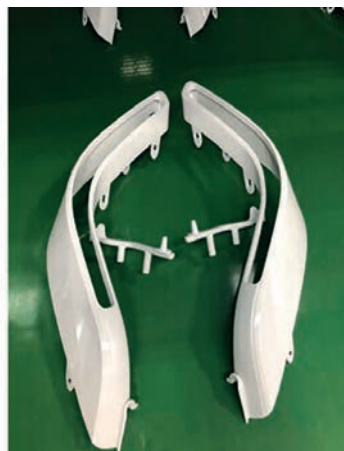
Fig 3. In plain language: the screen of a Thermo-5 with Eco-pump shows both setpoint and return temperatures, the flow rate, as well as the current power saving and the total energy saved per unit (left). The display values were determined in Wieselburg during an experiment on series production of a bezel (right)