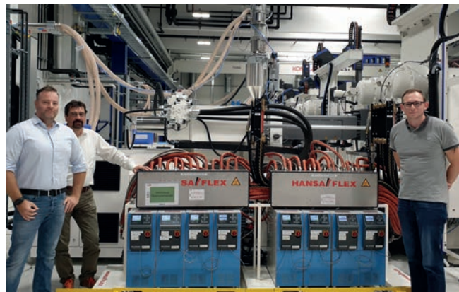
Fig. 2. Close cooperation (from right): Markus Benedikt, Process Engineering Injection Moulding at ZKW, Wilhelm Aschauer of Luger, the Austrian HB-Therm representative, as well as Marco Lammer, Area Sales Manager of HB-Therm

units in operation, 27 from series 4 and 609 of the Thermo-5 type (Fig. 1). In addition, flow meters (Flow-5), cleaning units (Clean-5) as well as switching units for variothermal temperature control (Vario-5) are used as needed. The ZKW headquarters thus work exclusively with HB-Therm equipment.