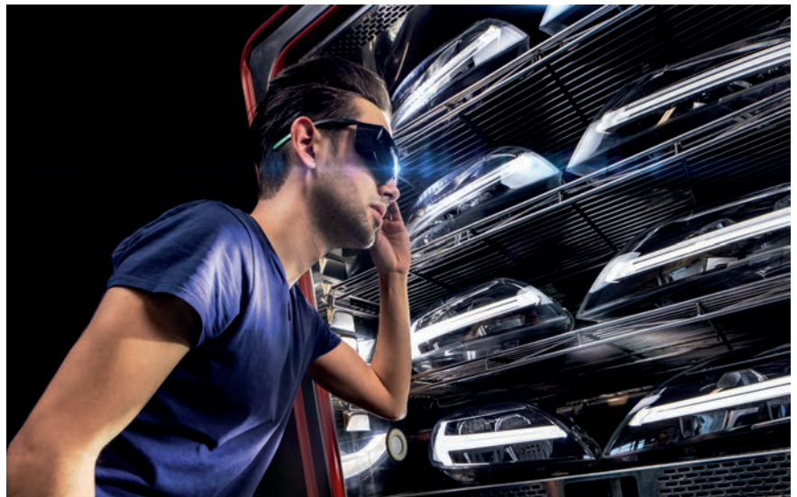
ZKW manufactures both complete lighting systems and the necessary components, such as diffusers and lenses or the associated electronics

Besides its headquarters and other sites in Austria, ZKW also maintains branch sites in Slovakia, the Czech Republic, as well as China, South Korea, India, the USA and Mexico. Benedikt continues: "According to our philosophy of following our customers into the key growth markets, ZKW has also exported over 95 percent of its products from Austria throughout the world for years. ZKW locates its production where the growth